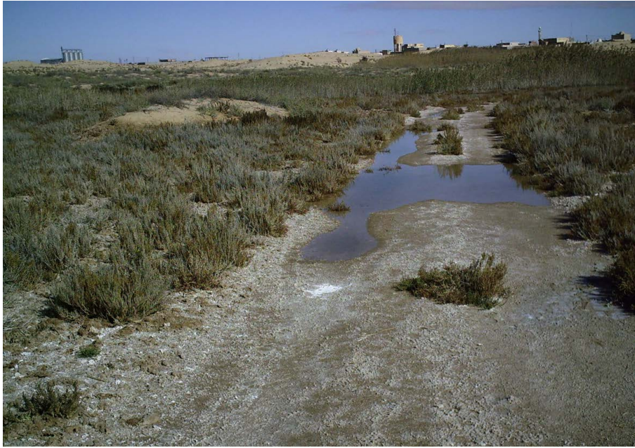
Figure 4. An agricultural soil affected by salinisation in waterlogging area

have become more suitable for life than before. Eucalyptus camaldulensis planted within the urban fabric contributed to cooling the summer temperature and contributed to pollution combat by absorbing thousands of tons of carbon dioxide. Furthermore, Eucalyptus camaldulensis planted in the surroundings of cities have contributed to creating a space for sports, leisure, and recreation. In the context of biodiversity, Eucalyptus trees have become the habitat of many bird species such as Streptopelia sp.