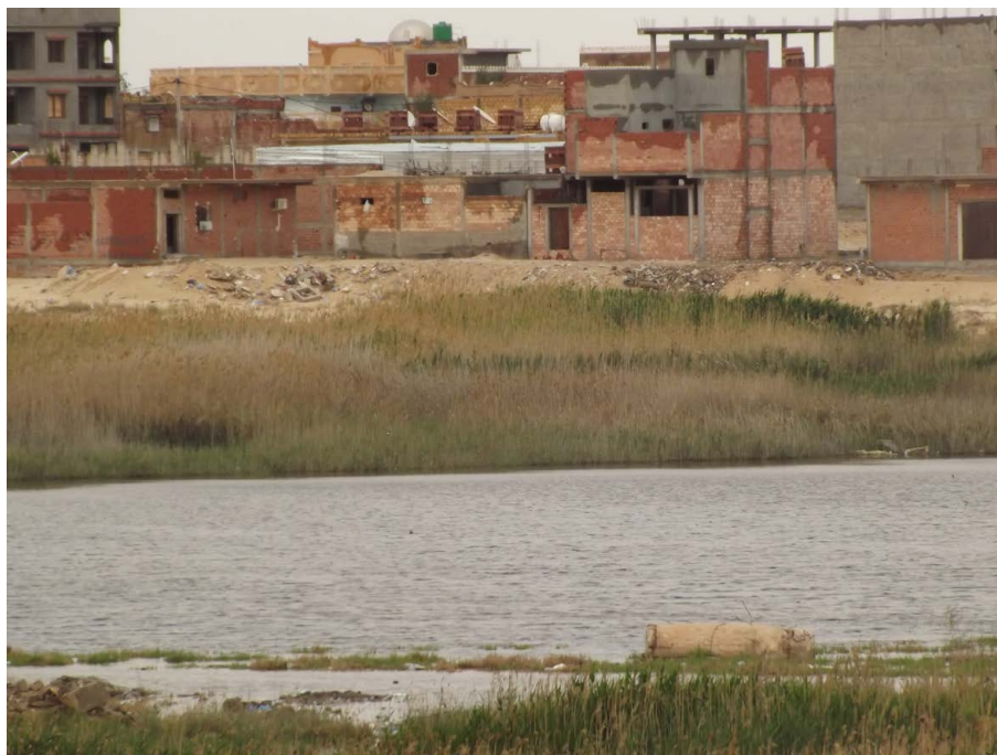
Figure 2. An urban area affected by waterlogging

In the last three decades of the previous century, the Souf oasis suffered from water disturbances that affected mainly the phreatic aquifer. These imbalances resulted in the rise of water levels both in urban