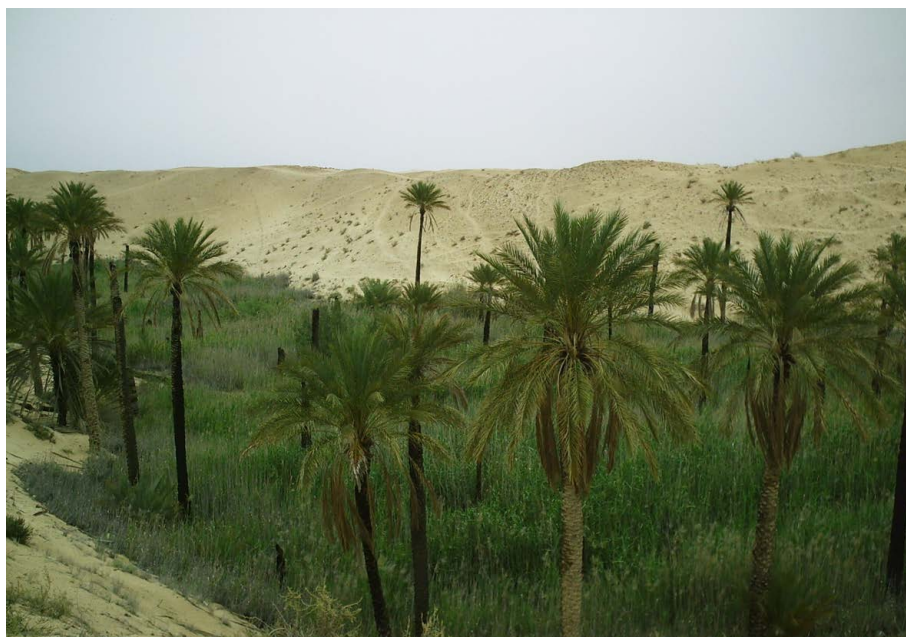
Figure 3. An agricultural area affected by waterlogging (Ghout system)

In addition to its role in the waterlogging combat, the green project has presented many socioeconomic, biological, and ecological benefits. The Souf oasis cities