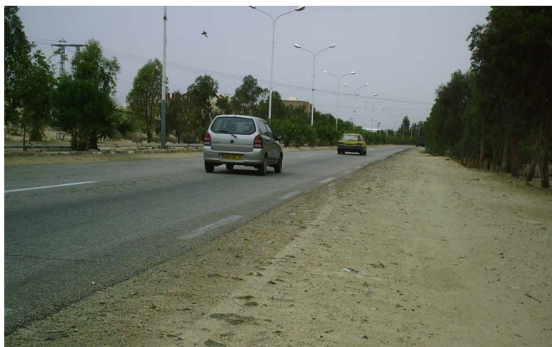
Figure 5. Eucalyptus camaldulensis forestation outside cities

According to Ma et al. (2020), the roots of the Eucalyptus sp. continue to grow and penetrate the soil layers to search for groundwater. As a result, the trees will continue exploiting the groundwater and reducing it to critical levels, making it difficult for farmers to use it. It is expected that the study area will not suffer from the problem of water inundation in the future, which is in line with the expectations of the study by Khezzani &